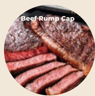
Beef Rump Cap