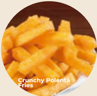
Crunchy Polenta Fries