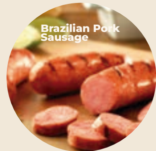
Brazilian Pork Sausage